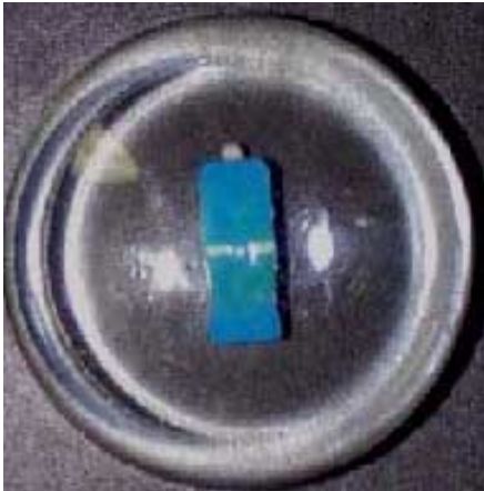
Figure 1: Image of the fiber optic connector used for the cutting experiment. The connector has been embedded in a resin mold to preserve the geometry of the part and prevent other portions of the connector from falling out following the cutting process.

Several fiber optic connectors were obtained for cutting experiments using the Model 850 Wire Saw. Different connector types were mounted in a resin mold and encapsulated to ensure that all of the components contained in the connector were preserved following the cutting process. Below is an example of the connector type used for evaluation.